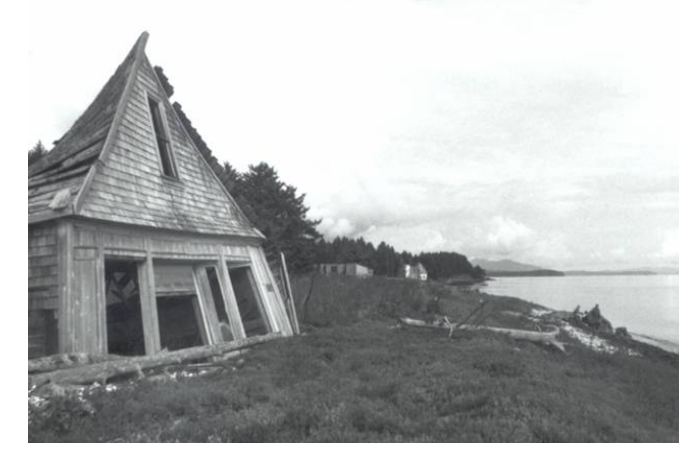
Fig. 17: Home decaying at Old Afognak Village

houses are still there, slowing decaying, like a wound that never heals. The graves are eroding. Our ancestors are being swept into the