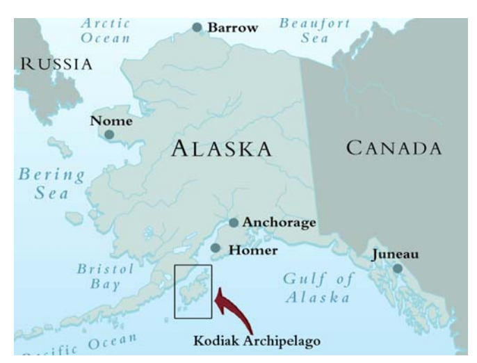
Fig. 1: Kodiak Archipelago Map

The Kodiak Archipelago is located 225 air miles south of Anchorage in the Gulf of Alaska. Afognak Island is the second largest island of the archipelago. The Kodiak Archipelago is a temperate rain forest, with a mild climate from the warm Japanese current. The temperature remains