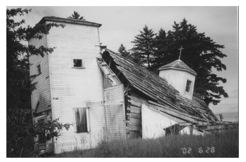
Fig. 14: Afognak Russian Orthodox Church, 2003

nature take its course while others want to stabilize the cemetery and prevent future erosion. As this is debated the graves continue to wash out to sea.