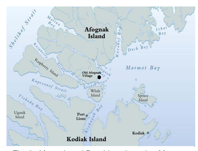
Fig. 2: Afognak and Port Lions Location Map

The primary focus of this case study can be best characterized in two parts. The first section evaluates the relocation of the Afognak Village residents after the 1964 Earthquake and Tsunami. Utilizing firsthand accounts of Afognak residents and the author's personal experiences as an Afognak