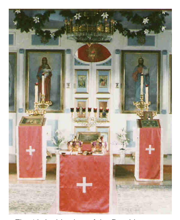
Fig. 12: Inside view of the Port Lions Russian Orthodox Church

not as prominent in the community that it once was. Fewer people attend service and follow the strict rules of Lent and other Orthodox customs. I do, however, recall seeing the Russian Orthodox maskers get dressed up and go house to house trying to fool one another. They did not come to our house because we did not practice Orthodoxy, so I always had this sense of being left out, or divisions in the community. The Russian Orthodox children used to tease me when I was growing up because I was