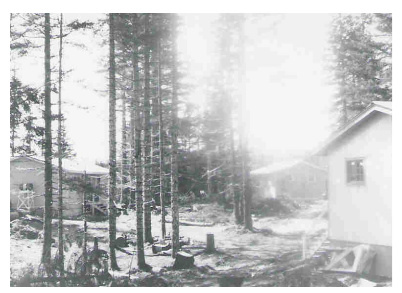
Fig. 9: Homes being right next to each other on wooded lots in Port Lions without a view of the ocean.

In the meantime, state engineers from Anchorage came to check the chosen site. They decided it would be ideal for an airstrip.