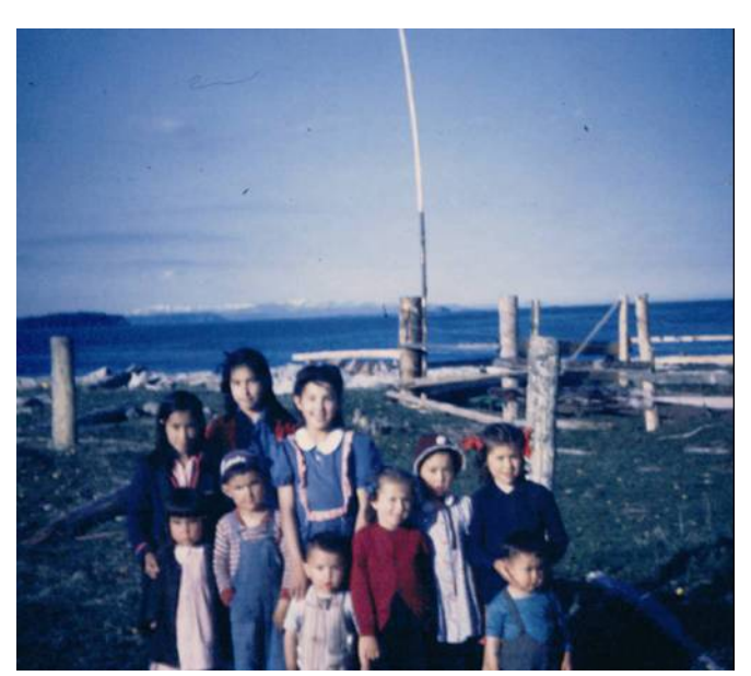
Fig. 4: Children in Afognak

The people of Afognak Village were a community. They relied on one another, valued each person's contributions, and celebrated the intricacies of life together. The Afognak people often talk of the big gatherings the community would have when everyone would come together to visit and celebrate.