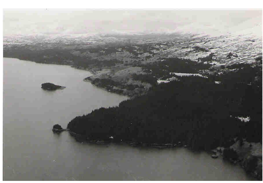
communities, forever altering Fig. 8: The future location of Port Lions in Settlers Cove the composition of the village residents.

Once the people chose the site of their new village, they were faced with the momentous task of building a village from the ground up. Some chose to relocate to Port Lions and still others chose to move to Kodiak and other communities, forever altering