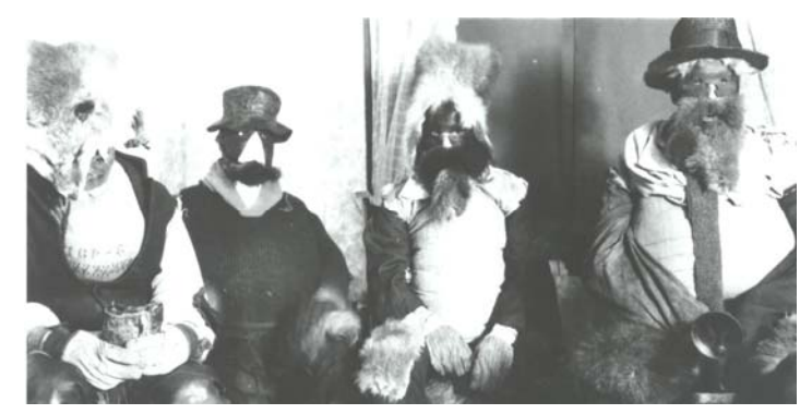
Fig. 5: people dressed up for masquerade party in Afognak

My next door neighbor, who was Paul Chichenoff and