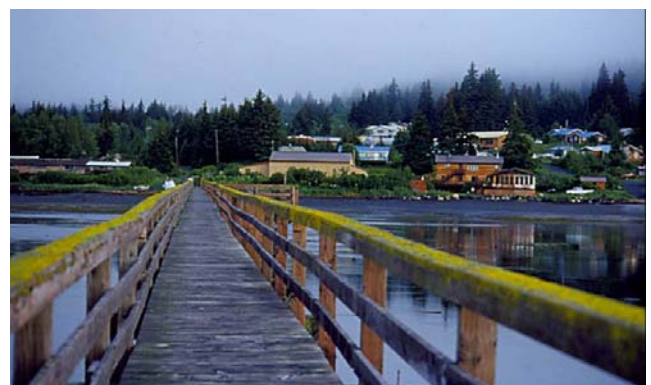
Fig. 15: Native Village of Port Lions, 2003

Port Lions is my home – it's where I grew up. There are dense spruce trees covering the large hills, huge bays that expand on either side of the village and mountains that stretch