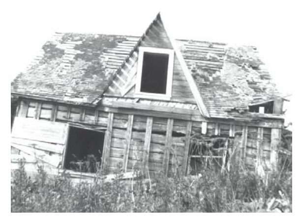
Fig. 16: Old house at Afognak Village after 1964

lying on the floor, a Reader's Digest from March 1964 that was soaked from the recent rain. I saw life in the houses, spirit in the community. If the walls could talk, what stories they would tell? Some might say Afognak is a 'vanished village' a 'ghost town'. I see it as a pause in time, a sort of three-dimensional scrape book of the memories that link people from Afognak.