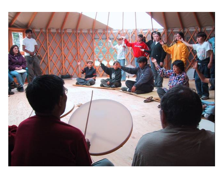
Fig. 18: People learning Alutiiq dance at Dig Afognak Camp

Hegna's speech captures, in many respects, our spiritual connection to our land and emphasizes how sacred the Old Afognak Village is to our people. The