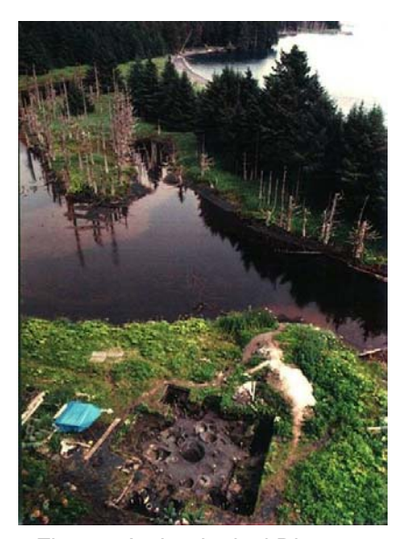
Fig. 19: Archeological Dig at the Dig Afognak Cultural Camp

...I go over for Dig Afognak it's just, you can just see how primitive it was when you get into the pre-historic site. And it just gives you a lot of appreciation for those people 'cause they worked hard just to survive. And that's what life was just plain old survival and it really is an eye-opener and it really puts me, it's a spiritual awakening to go over there and to learn those things of the past. I thoroughly enjoy it that's very important to me and its important to me to pass things like that onto my grandchildren because they will never know stuff like that if we didn't record it, if we didn't have the museum to put these things in. So hopefully some of my things that are important to me ...will someday be important to my grandchildren.<sup>51</sup>