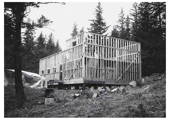
Fig. 10: Home being built on hilly, wooded lot in Port Lions

The Lions found they could finance only seven houses. The rest, thirty-eight houses, were built by the BIA....The Afognak residents found their villages rearranged. Instead of a single row of houses each with privacy and a view of the beach, the new Port Lions was a carefully laid out town of moderately large lots arranged in semi-circles among great spruce trees. Rather than the preferred unobstructed view of the beach, tides, boats and planes, all but a few houses on